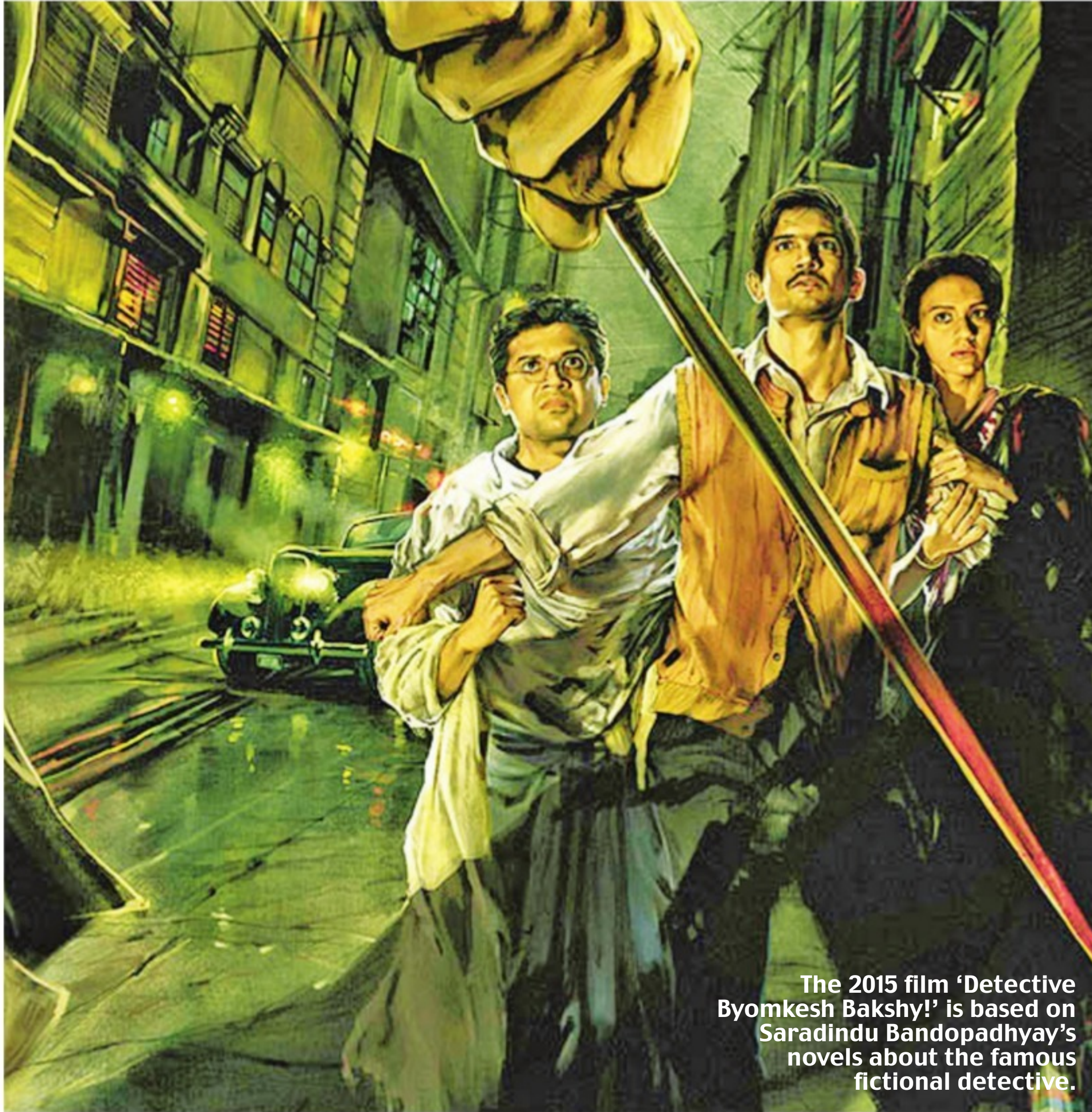
The 2015 film 'Detective Byomkesh Bakshi!' is based on Sharadindu Bandyopadhyay's novels about the famous fictional detective.

"World over, the top ten titles typically are crime fiction. I think it's a matter of time that it will catch on in India. We have to also understand the fact that commercial fiction writing is only ten years old in India. We've not had the necessary amount of time to evolve. I believe in the next two or three years, it will become one of