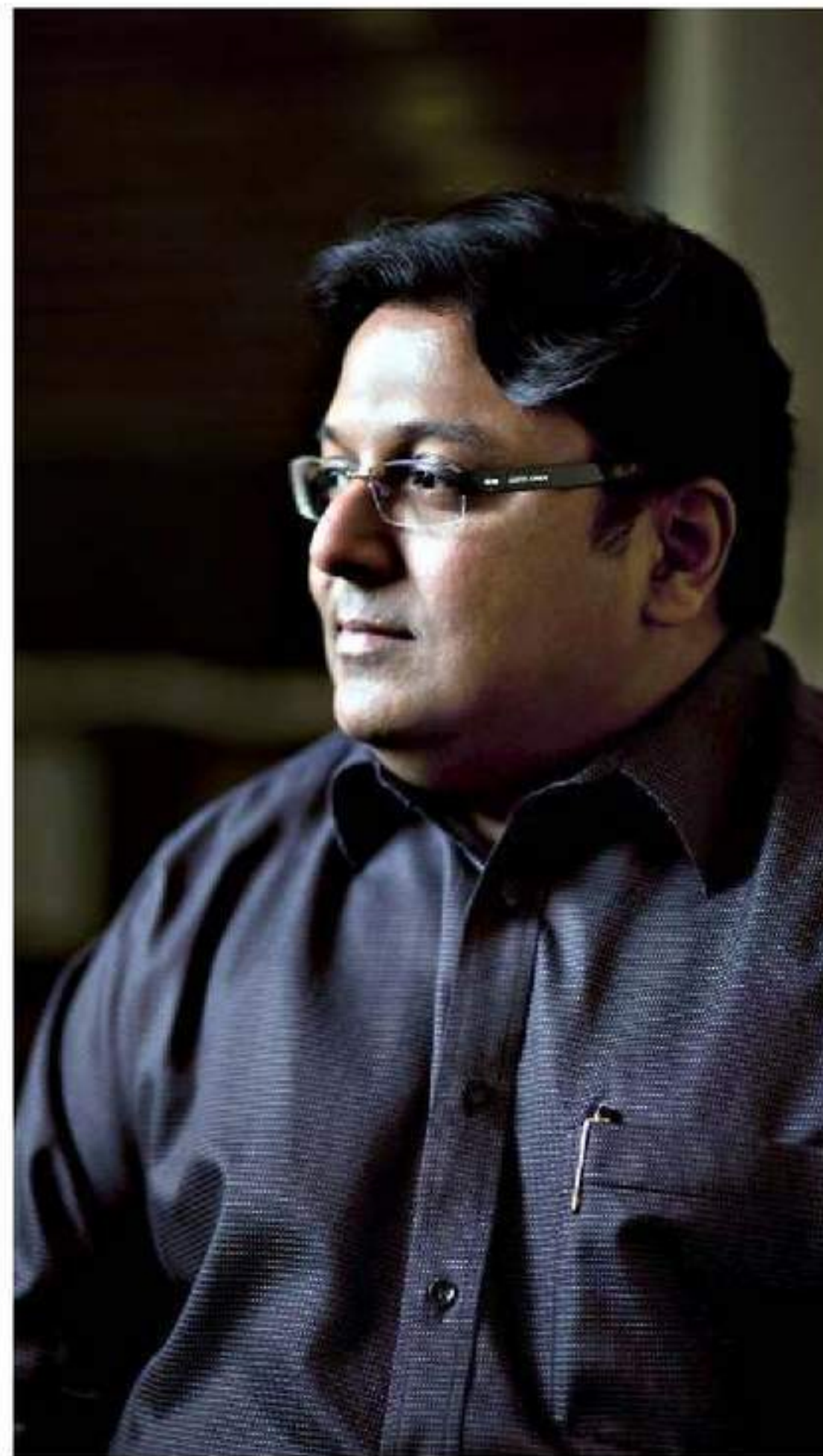
A NEW LOOK At a much-known story of Krishna that talks of the Kalki avatar

Let's stop looking at social media as social media. It is simply a series of communication channels. In my world, platforms like Facebook, Twitter, and YouTube allow me to reach out to my readers far more effectively than I would ever have been able to without them. These channels also allow me to receive direct feedback from my readers.